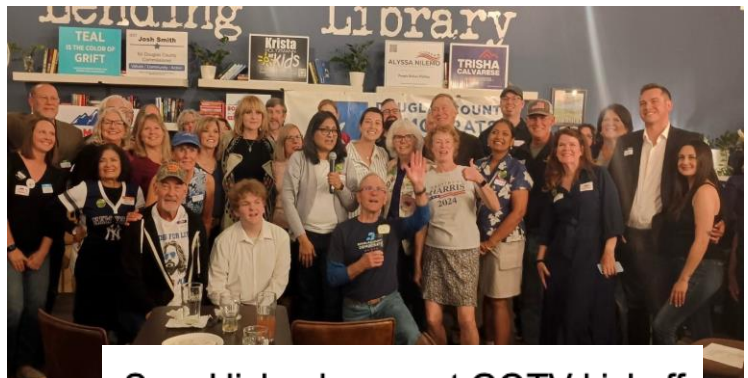
Sen. Hickenlooper at GOTV kickoff with Douglas County Democrats