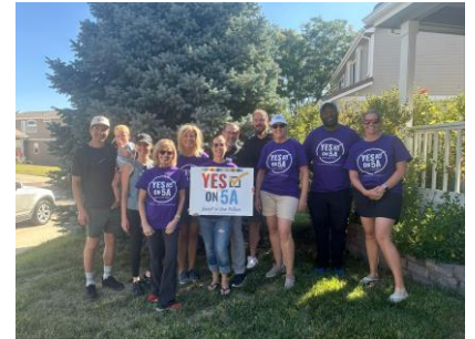
Canvassing kickoff for DCSD 5A Bond Campaign

Douglas County 5A Bond (endorsed by local)