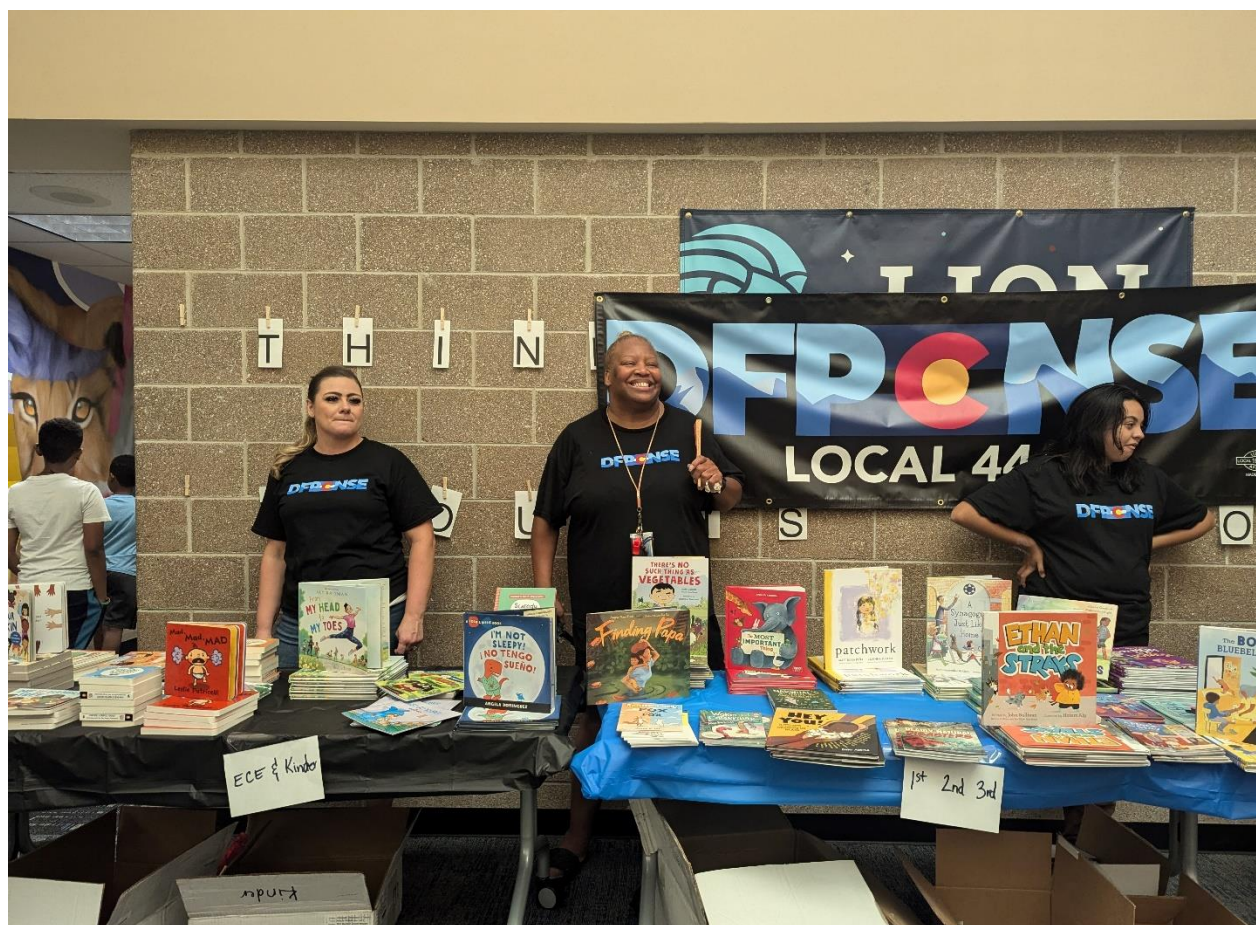
First Books 2024 - Denver Federation Paraprofessionals and Nutrition Service Employees