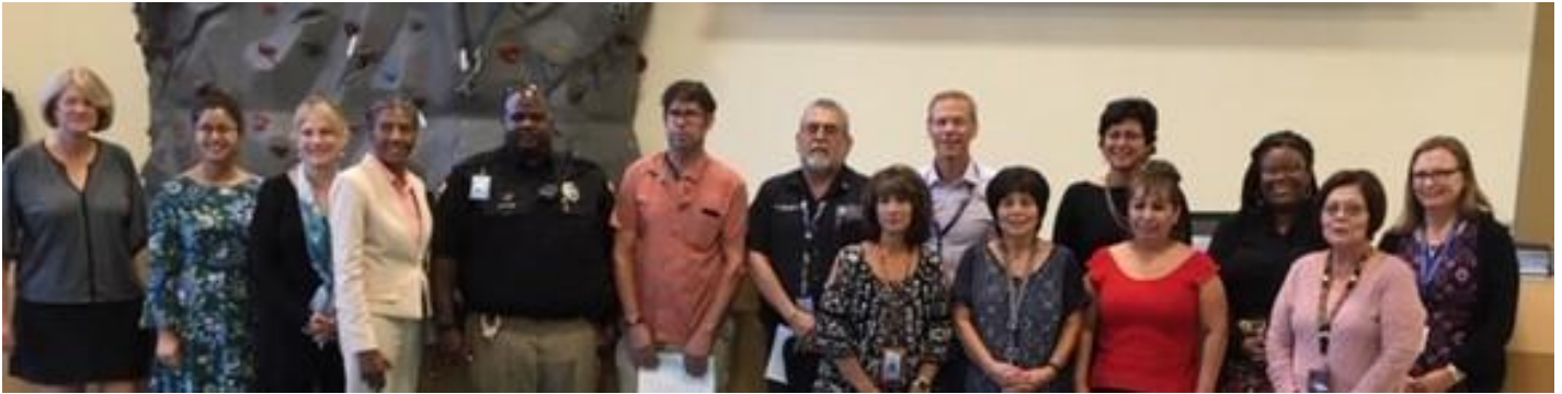
The Denver Public School Board recognized classified employees, along with presidents from associations and unions.