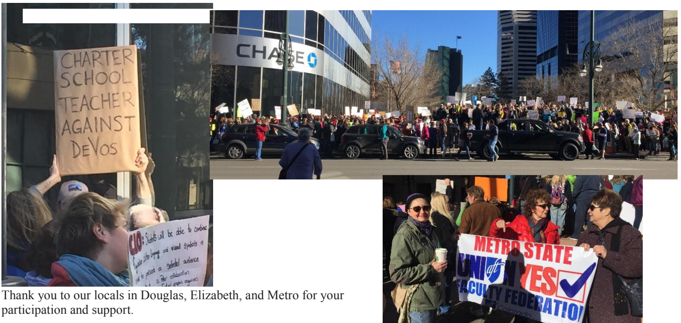
Thank you to our locals in Douglas, Elizabeth, and Metro for your participation and support.